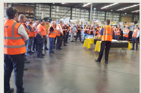
Perth Production Facility celebration.