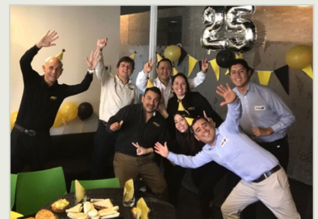
Santiago, Chile Office celebration.