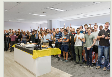
Perth, Australia Office celebration.

True to its word, the company is expanding their offering and releasing a number