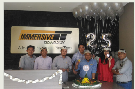
Jakarta, Indonesia Office celebration.