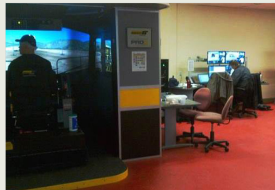
In addition to their training center programs, College of the Rockies also runs a mobile training simulator course and travels anywhere in Western Canada to deliver the program.